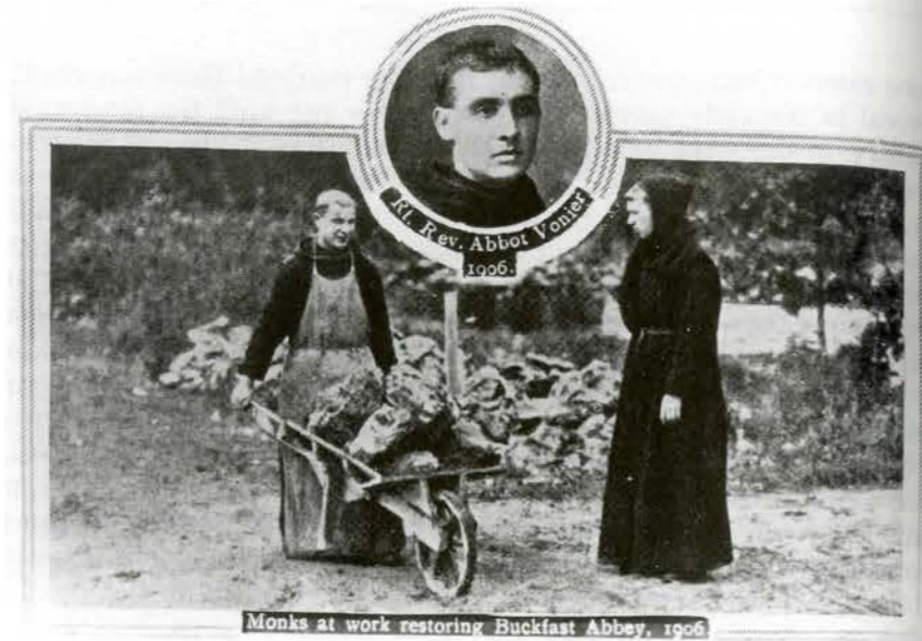
1906: Led by Abbot Vonier, work begins at Buckfast to build a new abbey on the site of the old.