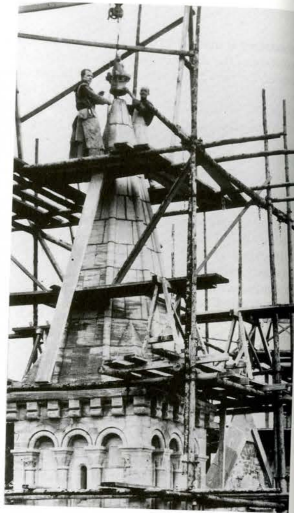
Using traditional methods, and usually with no more than four to six monks working on the project, the final stone of the Buckfast tower was laid in 1937.

The monastery of Quarr, in the Isle of Wight, was, like some of the other modern monasteries, a product of French Benedictines in the early twentieth century fleeing from anti-religious laws in their own country, and locating their new community on the site of a pre-Dissolution foundation. First occupied in its modern form in 1908, the monks, in addition to their religious duties, farmed the land and also acquired a reputation for various activities, including the composition of sacred music, painting, weaving, carpentry and book-binding. In addition to Benedictine monasteries such as Quarr, there were examples of other orders in this period. The Cistercian Mount Saint Bernard, in Charnwood Forest, Leicestershire, dates from the first half of the nineteenth century, and its buildings are distinguished by the exotic architecture of Augustus Pugin, as well as a new church completed just before the outbreak of the Second World War. Other non-Benedictine establishments active in the