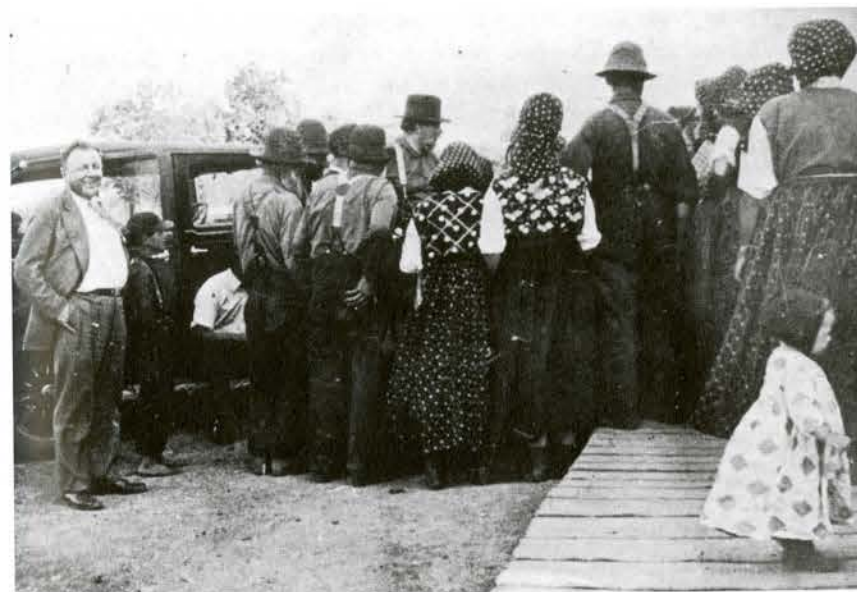
Eberhard Arnold's visit to a Hutterite community as part of his North American tour, 1930, which led to a merger between the two movements.

Spiritually, during this period, Arnold gained inspiration from the example of the Hutterites (or Hutterian Brethren), descendants of the pacifist Anabaptists dating back to sixteenth-century Germany. Arnold had for some time taken a keen interest in Hutterian writings, and in 1930, against the wishes of some of his followers, he made a visit to the farming communities in the prairies of Canada and South Dakota, where some 5000 Hutterites lived and prospered. Both parties gained from