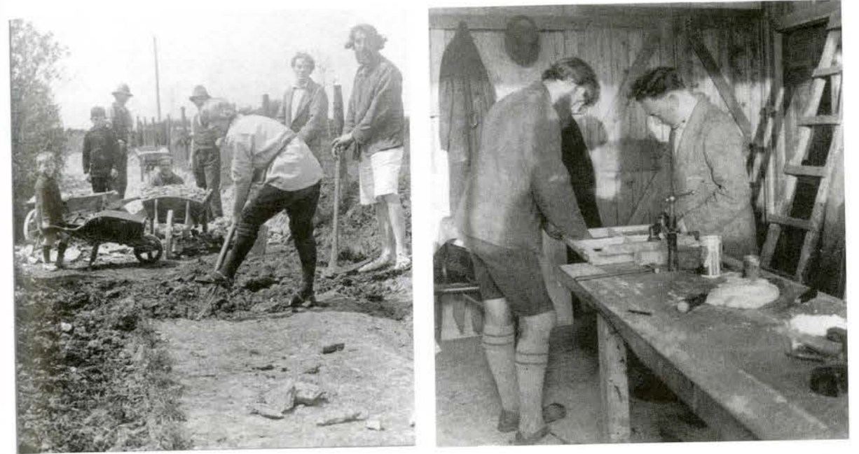
(Left) Roadbuilding at Whiteway, 1924.