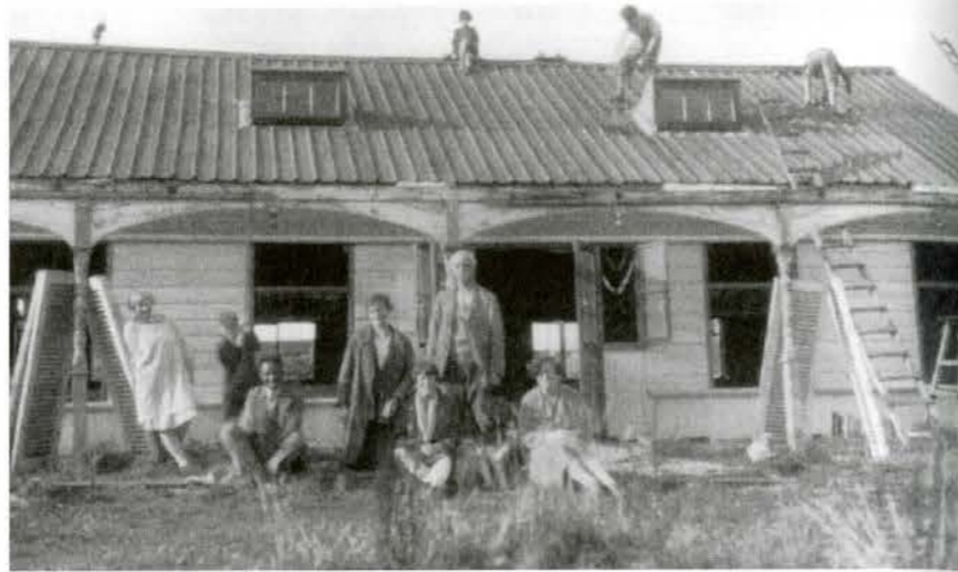
(Above) Nearing completion of the Colony Hall, 1925.