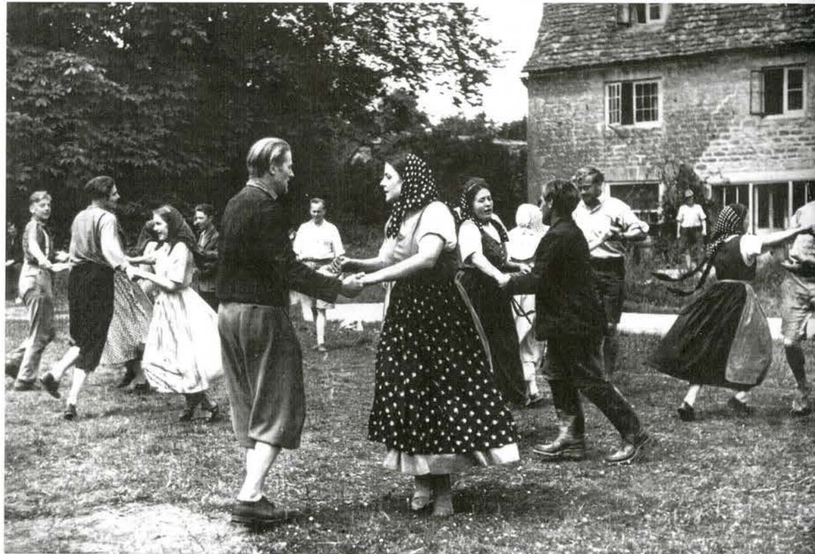
(Below) Cotswold Bruderhof members folkdancing, late 1930s.

decided unanimously, in faith in God's help and guidance, to try to buy the farm. Shortly afterwards the necessary means were placed at our disposal. 72 The source of this benefaction is not revealed, but close links with the Society of Friends suggest that it might well have been from that body. 73