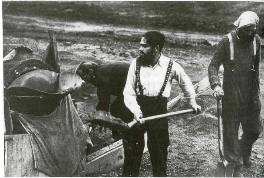
(Above) Building work at Ashton Keynes