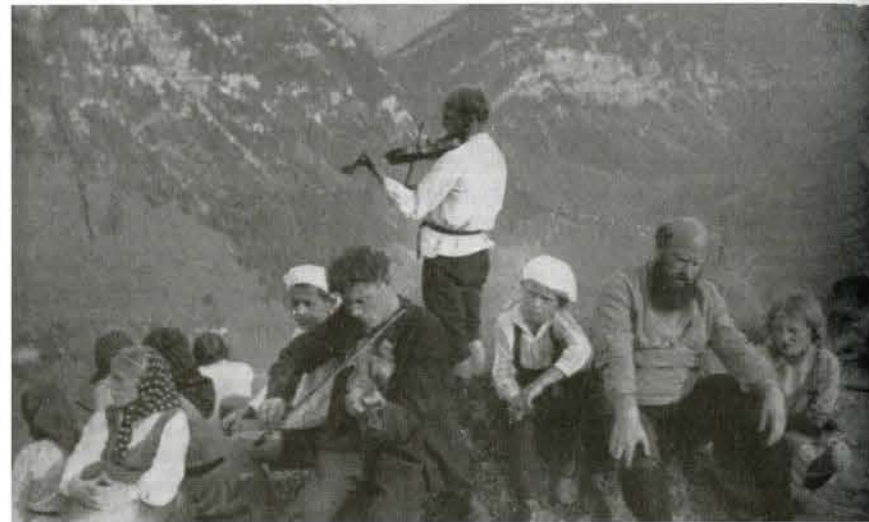
Bruderhof community in Liechtenstein, c. 1936.

restrictions in Nazi Germany. Joy was expressed at the reunification of the whole brotherhood in one place, with the prospect that 'united we could work with increased power at the task of building up a City of Peace.' 61 In early 1939 numbers in the community had grown to 250, one hundred of whom were children (including two adopted babies from English slum housing). Some of the newcomers came from abroad, particularly from the Sudetenland (in the face of Nazi occupation) and from Holland. Others were from Britain, fellow pacifists sheltering from the oncoming storm clouds of war. Particular satisfaction was gained from the arrival of seven communarians from Birmingham, known as the Handsworth Group, who had decided to close their own project in favour of amalgamation with the Bruderhof. 62