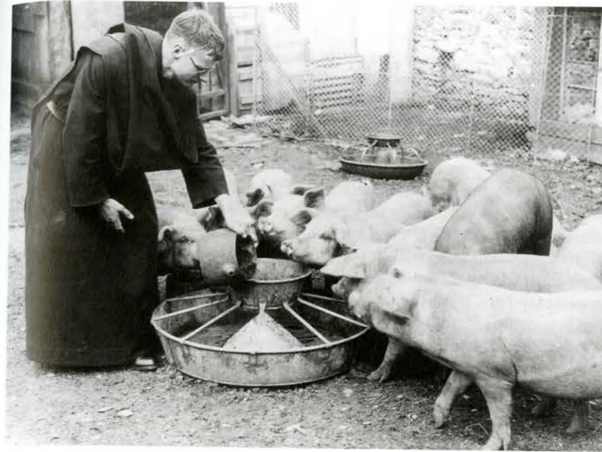
Less dramatic than the building work, but essential to its sound economic base of Buckfast, was the day-to-day management of the abbey estate.

The monastery of Quarr, in the Isle of Wight, was, like some of the other modern monasteries, a product of French Benedictines in the early twentieth century fleeing from anti-religious laws in their own country, and locating their new community on the site of a pre-Dissolution foundation. First occupied in its modern form in 1908, the monks, in addition to their religious duties, farmed the land and also acquired a reputation for various activities, including the composition of sacred music, painting, weaving, carpentry and book-binding. In addition to Benedictine monasteries such as Quarr, there were examples of other orders in this period. The Cistercian Mount Saint Bernard, in Charnwood Forest, Leicestershire, dates from the first half of the nineteenth century, and its buildings are distinguished by the exotic architecture of Augustus Pugin, as well as a new church completed just before the outbreak of the Second World War. Other non-Benedictine establishments active in the