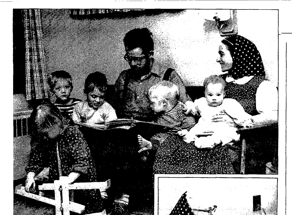
A Bruderhof family just before bedtime, and a grandmother at the computer terminal.

persisted in this communal pattern on into the third century. Since then no one group has maintained a community witness continually, but down through the years study of the New Testament has raised up many separate groups to witness to this concrete expression of overflowing love.