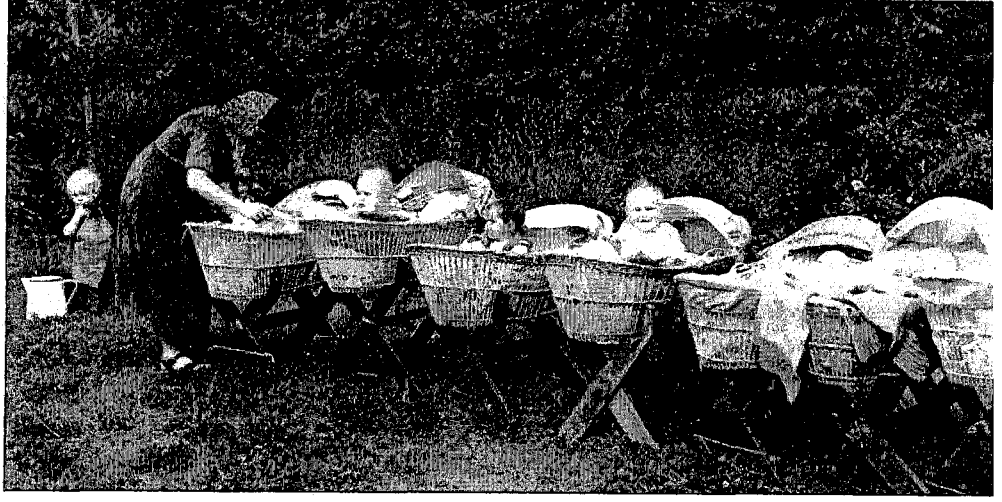
Babies at the Cotswold (England) Bruderhof in 1938

had a close call during the election of '64. Johnson was the dove, Goldwater was the hawk; and our sympathy for Johnson was so strong we nearly voted for him. Finally, we felt together that as people who were trying to follow the way of Jesus completely, we shouldn't vote. As it was, Johnson did exactly the same things Goldwater threatened, only much worse.