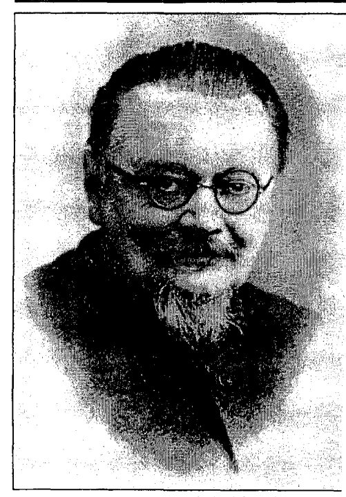
Bruderhof founder Eberhai

Whenever society is crumbling, as it is today, the church is tempted to align itself with political parties and national interests. In the beginning, this alignment seems to be a good thing, and it is justified on the grounds that the government will keep its Christian base if it